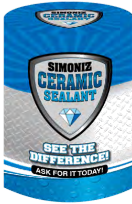
Ceramic Sealant Drum Cover Item# DC30 - 30 gallon drum DC55 - 55 gallon drum