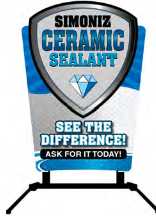
Ceramic Sealant Antenna Sign Item# ANWM - One Sided 42"x59" ANWMS - Two Sided 42"x59"