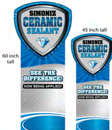
Ceramic Sealant Tunnel Fixtures 60" and 45" Great for IBA's Item# TUFIXL45 - 45" TUFIXL6 - 60"