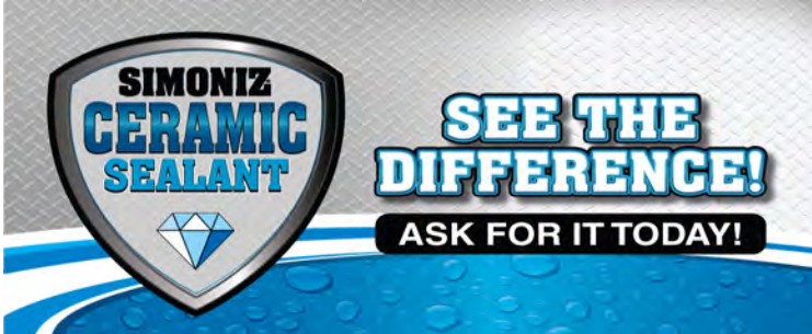
Ceramic Sealant Banner 96"36" Item# BA96x36