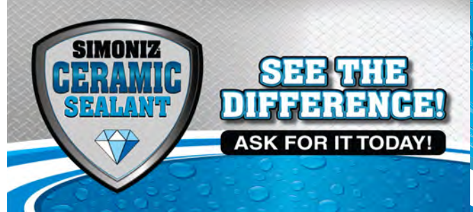
Ceramic Sealant Banner 72"36" Item# BA72x36MDS