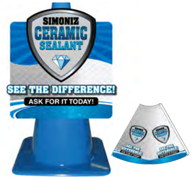
Ceramic Sealant Traffic Cones Item# COSL Cone Sleeve 28" COSI Cone Display w/cone COSIR Cone Display Replacement