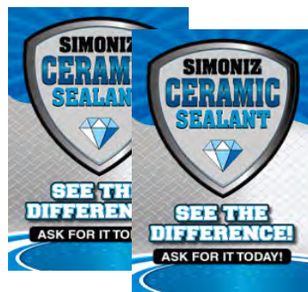
2 Windmaster inserts