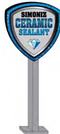
Ceramic Sealant 18" LED Lighted Sign Item# Customer 18"Shield