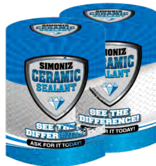
2 drum covers

CERAMIC1 Package includes a dosatron pump station for easy dilution control, delivery and consistency.