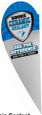
Ceramic Sealant Tear Drop Signs Item# 9ft Tear Drop w/Mounting 2 sided FG9 11.2ft Tear Drop w/Mounting 2 sided FG112 13.5ft Tear Drop w/Mounting 2 sided FG135