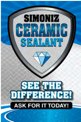
Ceramic Sealant Windmaster Insert - 28"x44" Item# WMIN2844